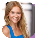
Miss Madison Co. Choreographer